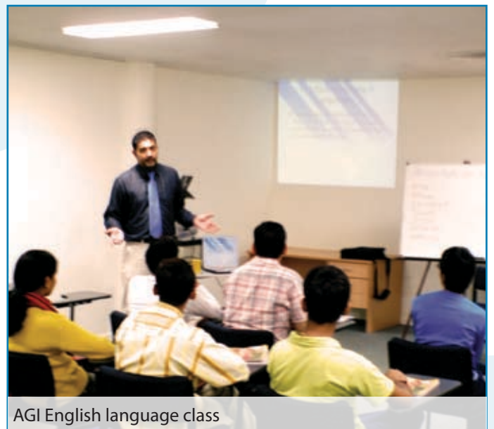
AGI English language class