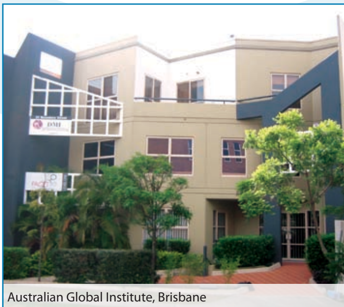
Australian Global Institute, Brisbane

Detailed enrolment and course information, including codes and competencies, can be viewed on our website, www.studyinoz.info